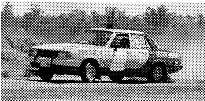
3 rd Outright Wade Hickey